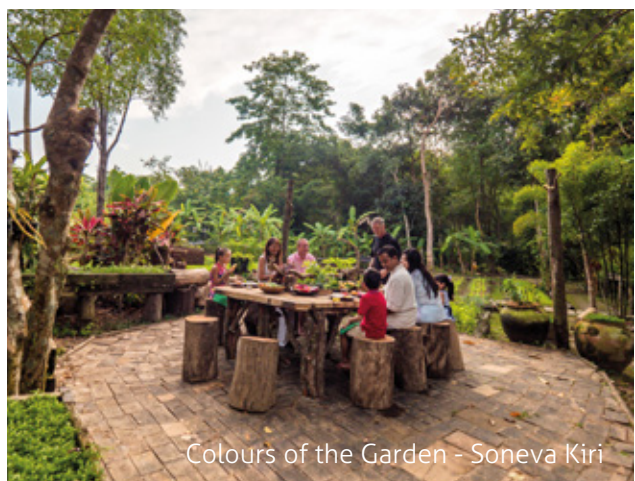
Colours of the Garden - Soneva Kiri