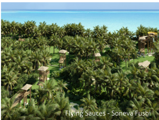
Flying Saucers - Soneva Fushi