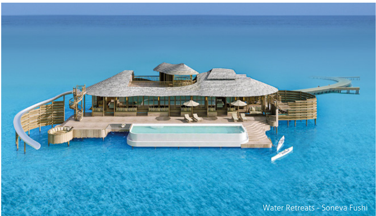
Water Retreats - Soneva Fushi

Colours of the Garden - Soneva Kiri - Venture on a journey through the four culinary regions of Thailand across four different menus. Begin the meal with a guided tour of the garden, where amuse bouche have been hidden along the way. Each menu has seven plant-based courses that use traditional Thai ingredients and Nordic cooking techniques and cooking methods. Each dish celebrates Soneva Kiri-grown and local organic vegetables, fruits and herbs.