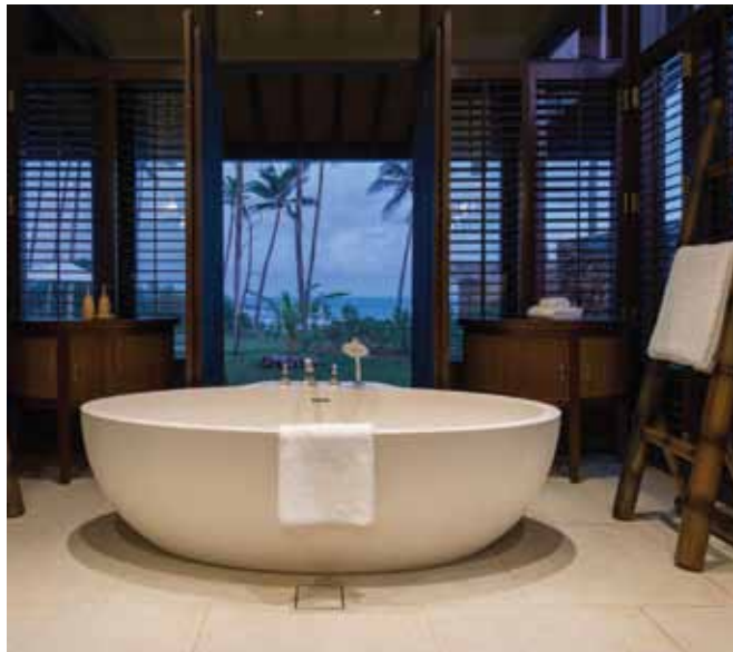
Every bathroom features a stone tub and steam room

► 7 Residences 130m 2 /1400ft 2 , king bed, verandah ► 8 Premier Residences 180m 2 /1950ft 2 , king bed, large verandah ► 3 Grand Residences 200m 2 /2150ft 2 , king bed, living room, large verandah ► 3 Cape Weligama Residences - 310m 2 /3400ft 2 , 2 bedroomed duplex. Ground floor – king bed, living room with bar, bathroom, large verandah. Upper floor – king bed, living deck with bar, 15 x 4m pool with panoramic ocean views.