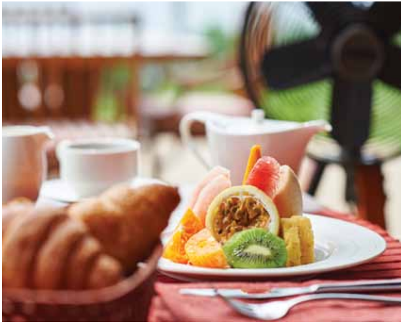
Breakfast at the oceanside De Mauny Dining Pavilion