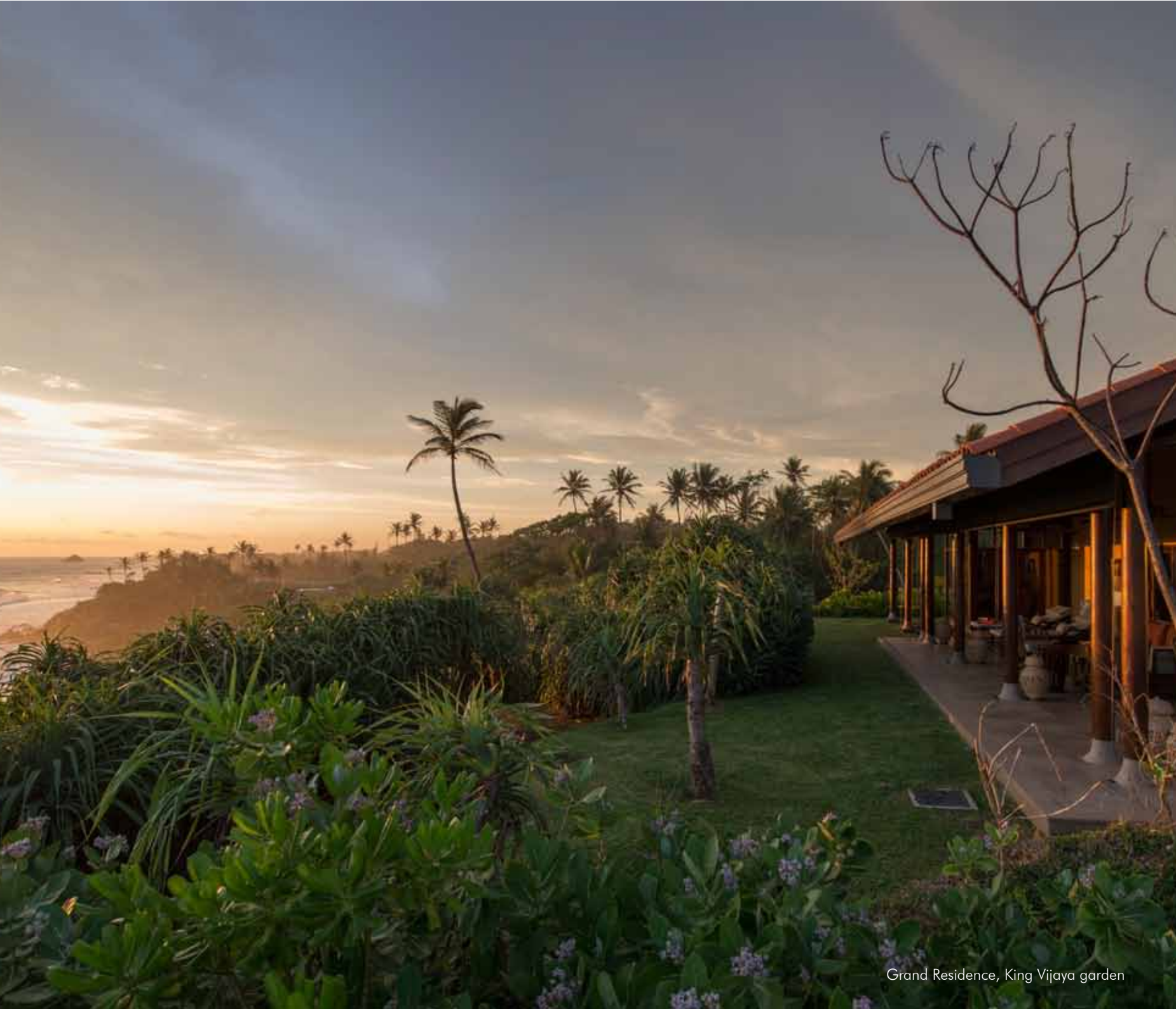
Grand Residence, King Vijaya garden