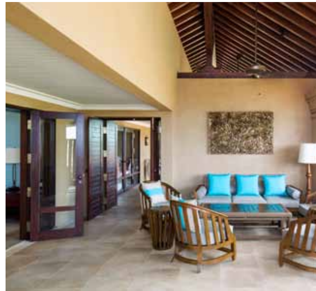
Interconnecting door on the verandah