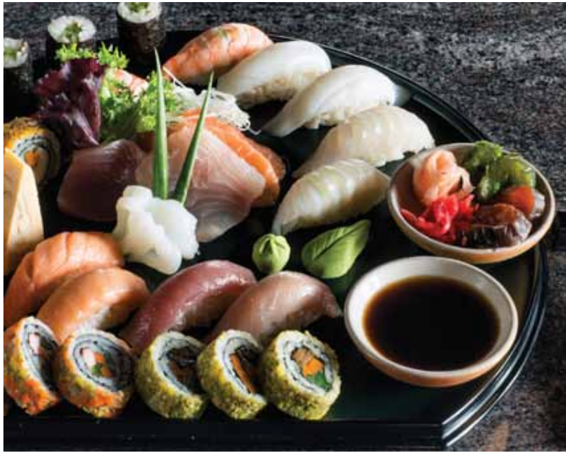
The cliff edge Misaki for Japanese cuisine