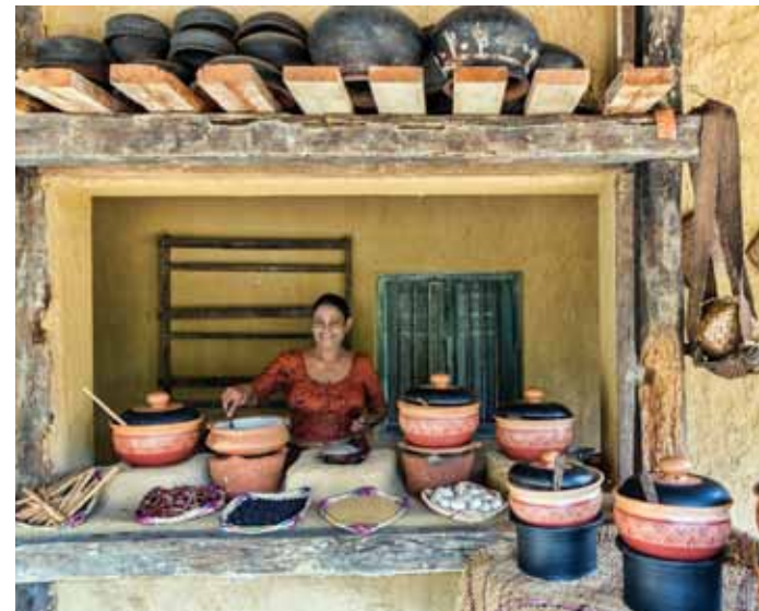
Kumbuk serves typical Sri Lankan village fare, al fresco