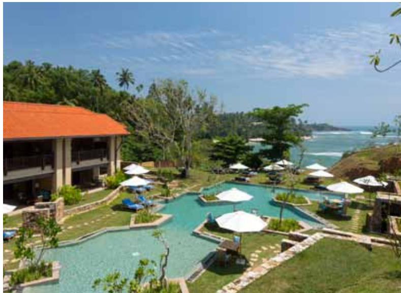
The Suites overlook the Cove pool

► 8 Master Suites - 145m 2 /1600ft 2 , king bed, large verandah