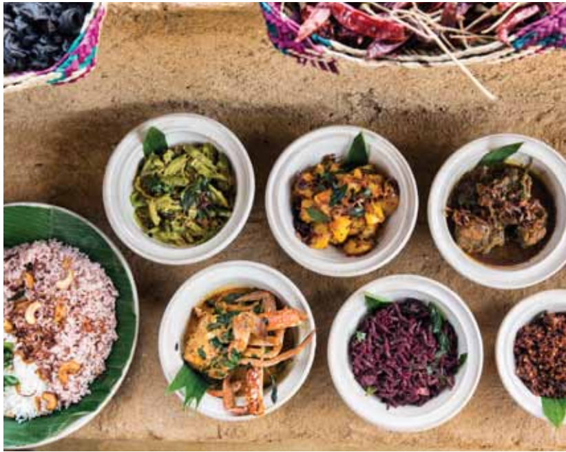
Eat like a local at Kumbuk