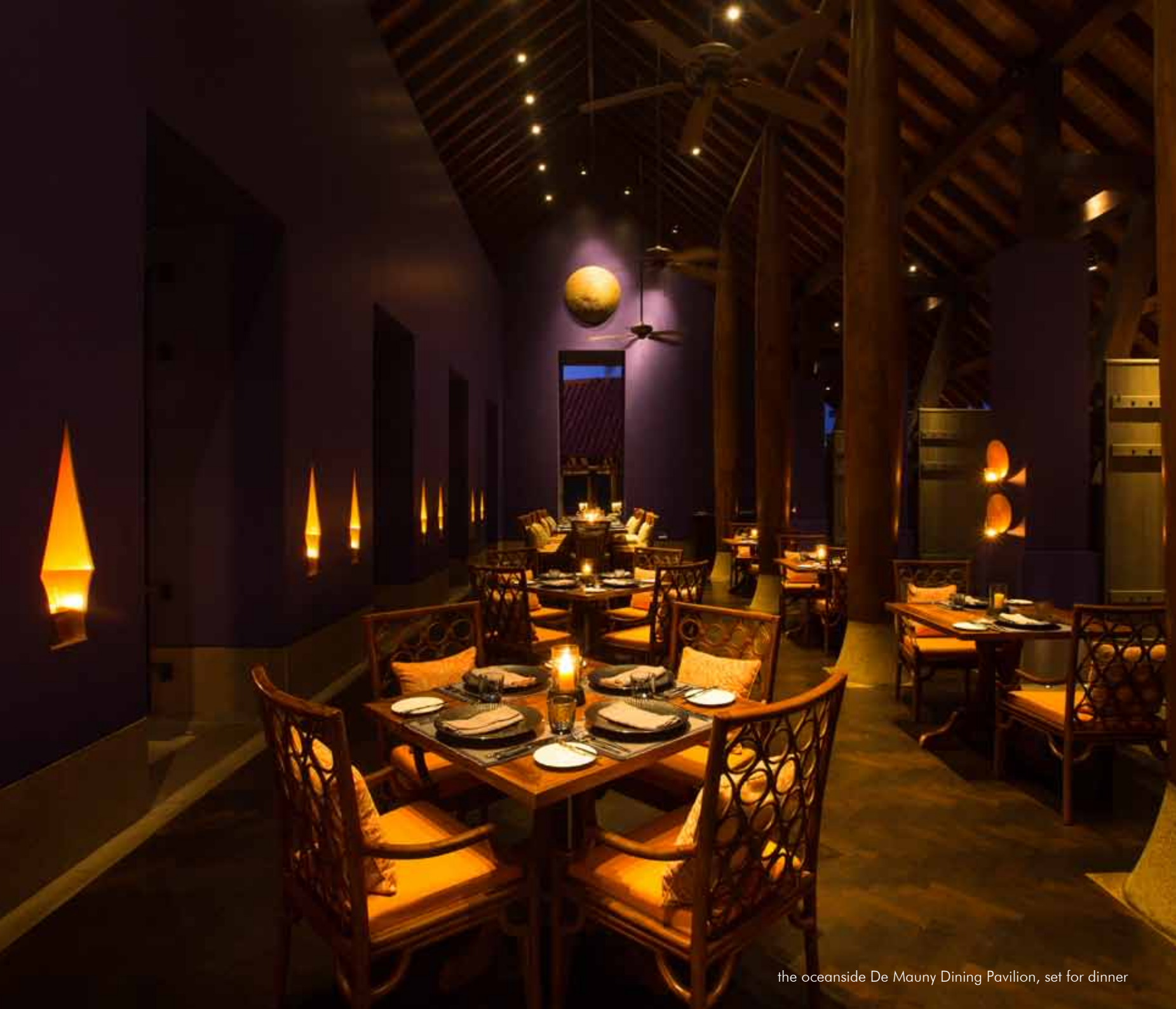
the oceanside De Mauny Dining Pavilion, set for dinner