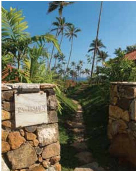
Entrance to a private Garden

Strategically nestled into the natural slopes atop Weligama's striking headland, a collection of private Residences and Suites; offering 39 bedrooms in all, create the welcoming illusion of a traditional Sri Lankan village. Yet beneath local terracotta-tiled rooftops, stylish interiors unfold as generously sized contemporary living quarters, each one surrounded by manicured garden. The smallest measures 130 square metres or 1400 square feet. Accommodations enjoy private butler services, individual gardens, dining and spa facilities. Each is named for a distinguished explorer or writer whose historic Ceylon journey captures the spirit of Cape Weligama.