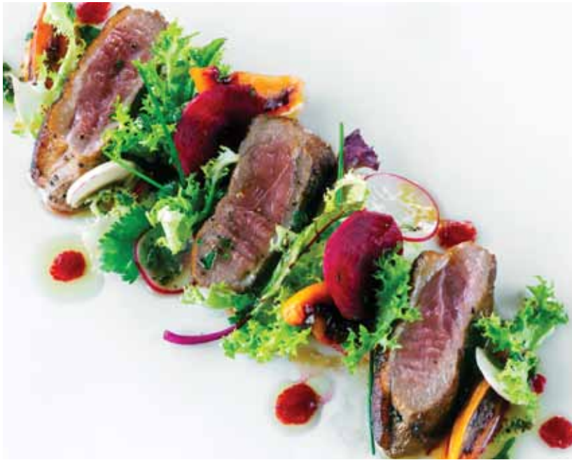
Innovative fare with a Sri Lankan touch