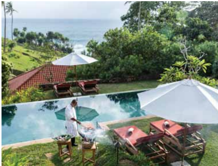
Summon a chef to whip up a BBQ in your garden

A gourmet paradise, Cape Weligama pays homage to its location with the day's freshest catch selected by you at Pola (the Sinhalese word for 'market') and cooked to order in the ocean facing De Mauny restaurant. Eat with your hands, Sri Lankan style, at Kumbuk, a casual open-air spot showcasing this island's unique and spicy curries. Opt for authentic teppanyaki at Misaki, dramatically poised at the cliff's edge, with nothing but azure expanse as far as the eye can fathom. The resort's hand-picked wines, included in the rate, complements these extensive East to West menus. The waterfront Taylor Pavilion provides a relaxed yet refined venue for traditional Ceylon high tea, as well as to linger over sunset cocktails and after dinner nightcaps under the stars. Rise with the sun, or as late into the day as you like, to enjoy a copious breakfast spread served on your private sea-facing garden-fringed veranda. The Resplendent Ceylon "no bills to sign" rates include all meals, afternoon cream tea, all beverages around the clock, including spirits and wines, room service, a daily activity, laundry, taxes & service charges.