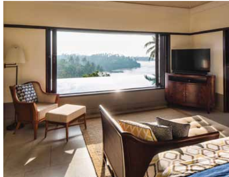
The 15m pool on the upper level of the Cape Weligama Residence