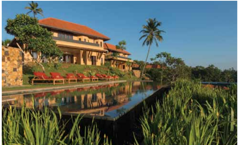
The Cape Weligama Residence, a two bedroomed duplex with 15m pool on upper floor