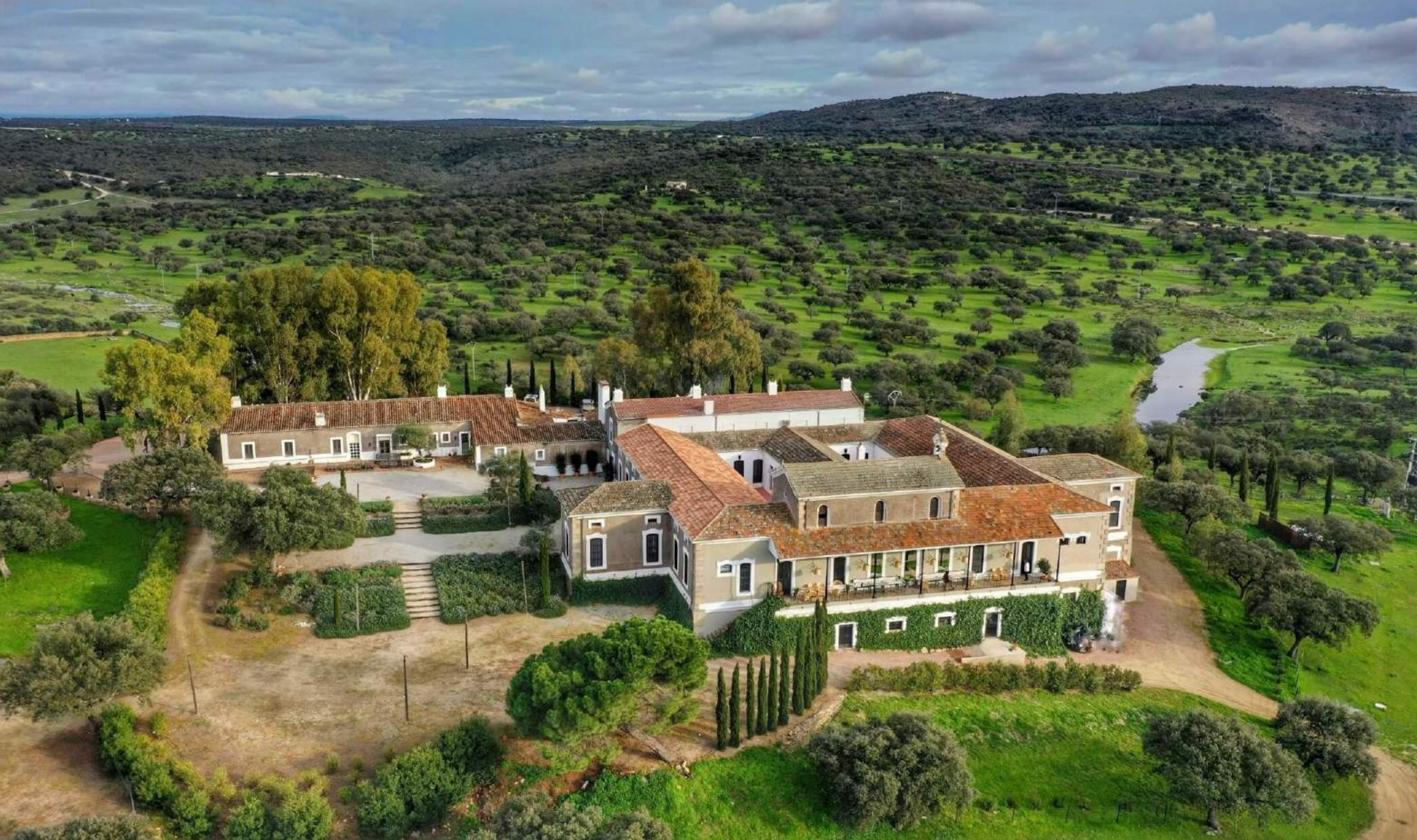
Palacio Santa Cristina Luxury Country House & Private Estate